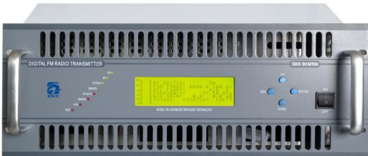
ZHC618F-2000W Transmitter front panel layout

ZHC618F-2000C is a compact FM stereo broadcasting transmitters. The advanced digital technologies, Digital Signal Processor (DSP) and Digital Direct Synthesizer (DDS), are used in the transmitters to get little size, high performance and high reliability. They are widely used for professional radio stations to transmit high quality FM radio programs.