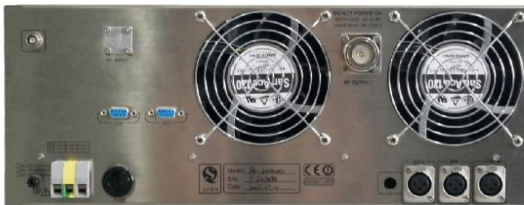
ZHC618F-2000W/C FM Transmitter Back panel layout